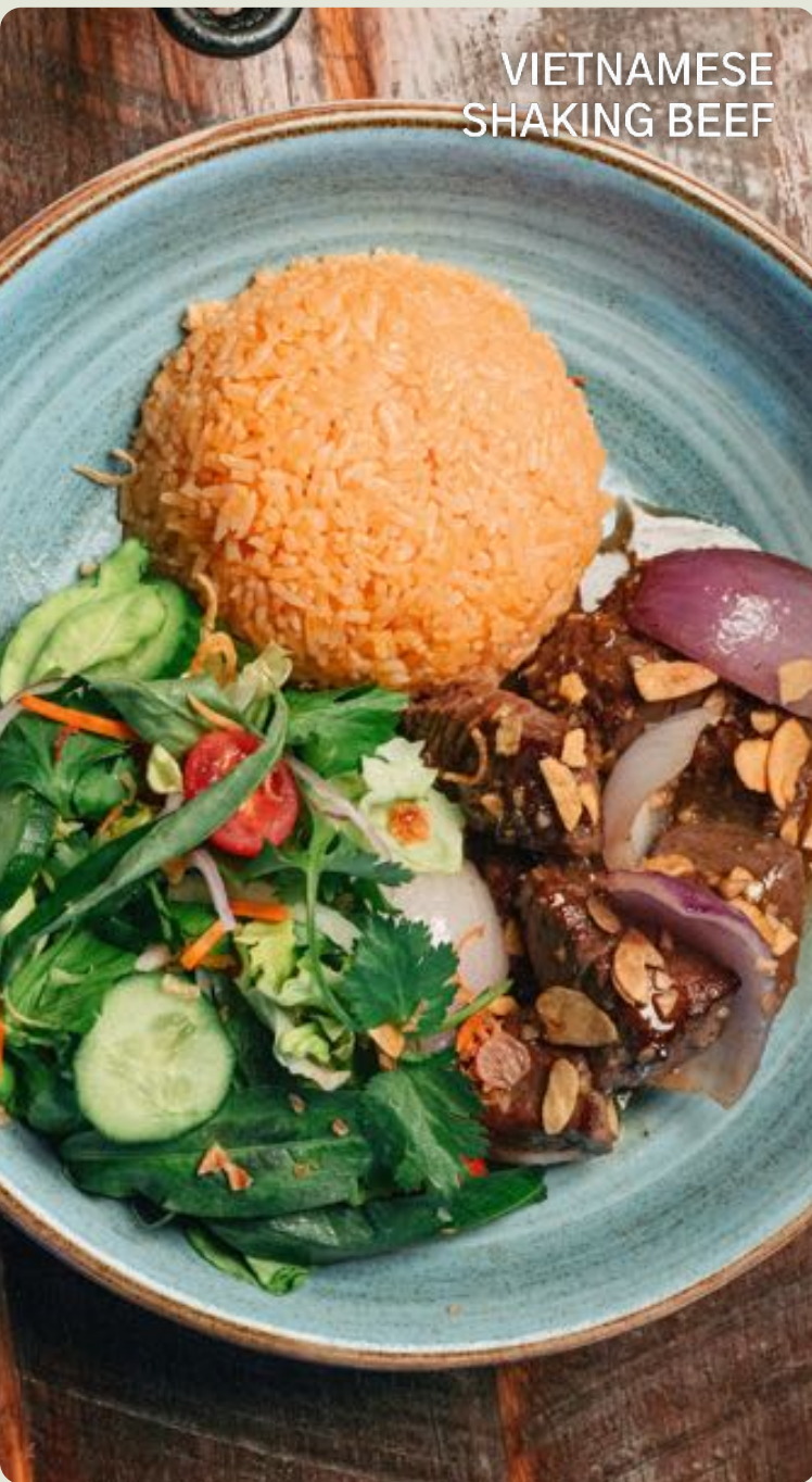
VIETNAMESE SHAKING BEEF