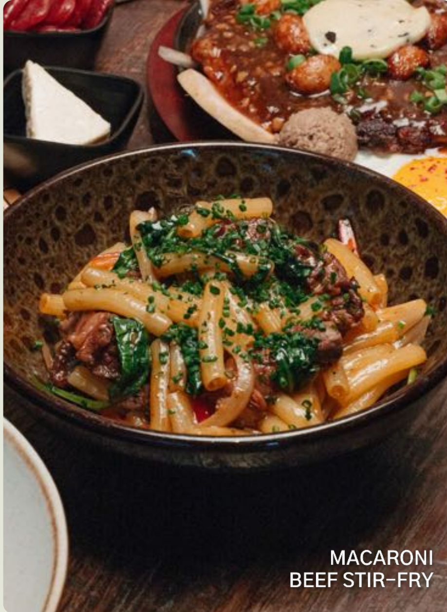
MACARONI BEEF STIR-FRY