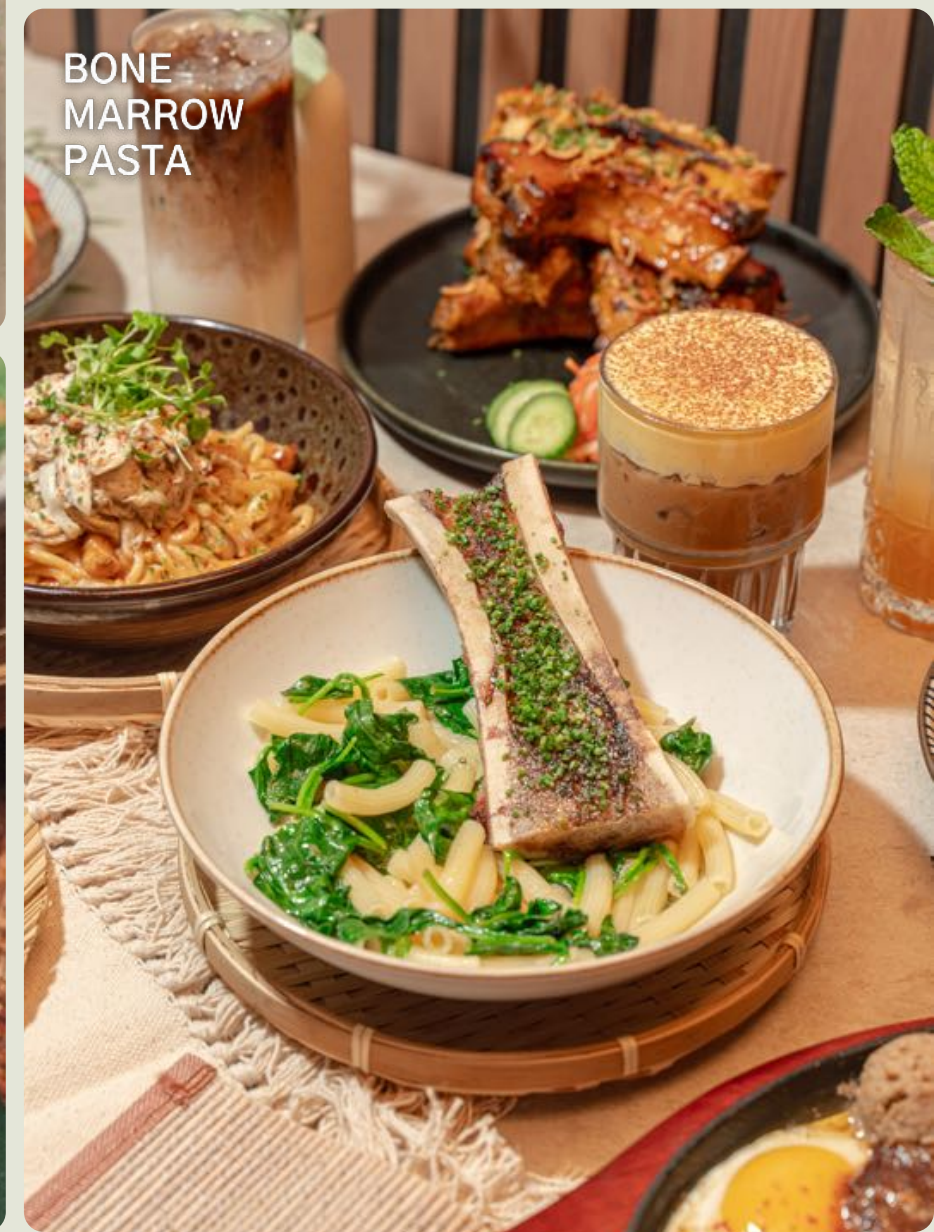
BONE MARROW PASTA