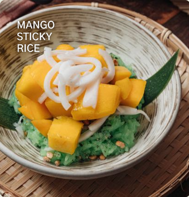
MANGO STICKY RICE