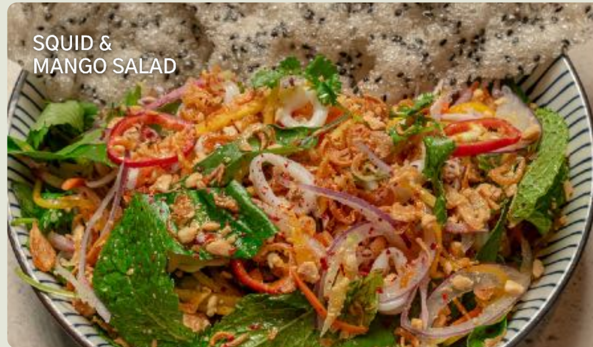
SQUID & MANGO SALAD