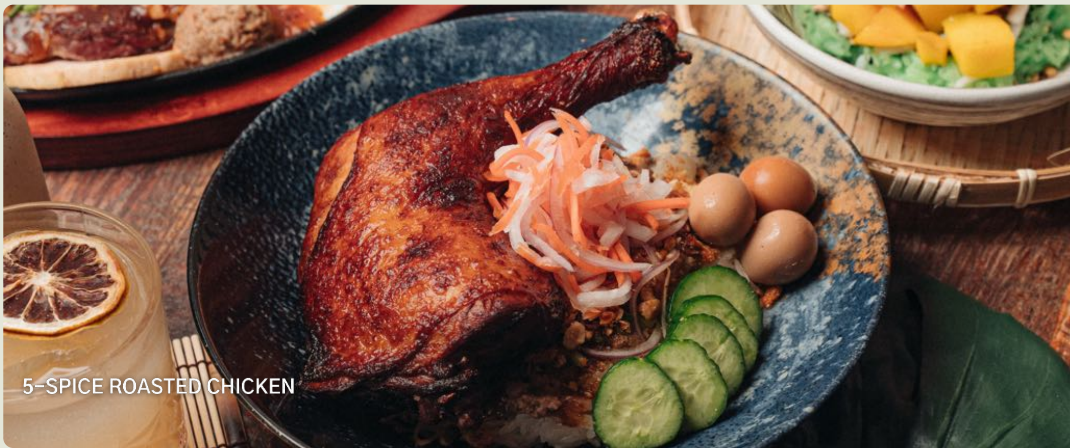
5-SPICE ROASTED CHICKEN