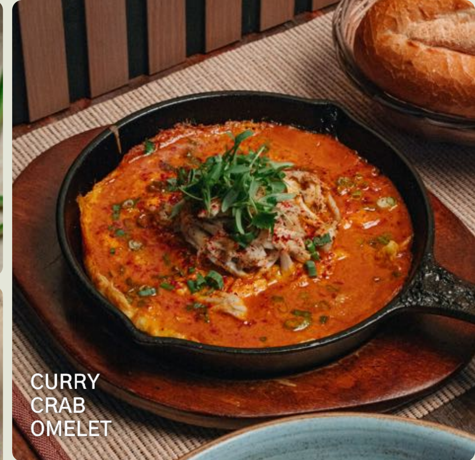
CURRY CRAB OMELET